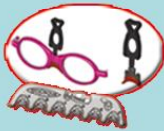
Nose pads suited for 6 nose shapes